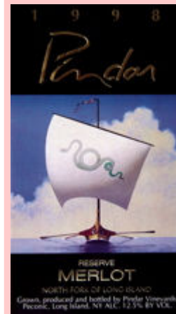
Pindar 1998 Reserve Merlot